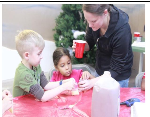
Check out our fun hands-on classes in the Creation studio